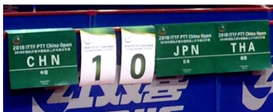
Team & Score Indicators

Assistant Umpire tables, Umpire chairs, Scoreboards, Surroundings and Towel boxes were DHS approved by ITTF.